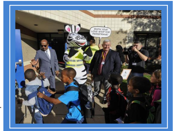
Walk to School Day 2016 at Ronald McNair Elementary School