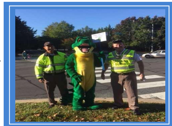
A Walk to School Day contest entry from William Gibbs Elementary School!