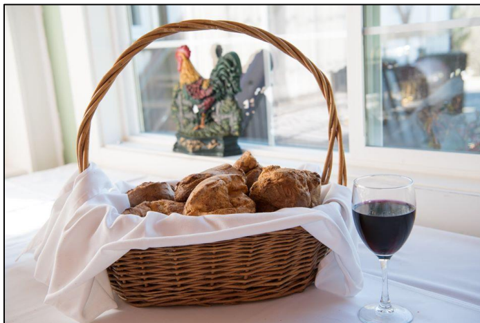
Normandie Farm Restaurant has More than Popovers

Business meeting/luncheons are held four times a year at the delightful Normandie Farm Restaurant, 10710 Falls Road, Potomac, MD 20854.