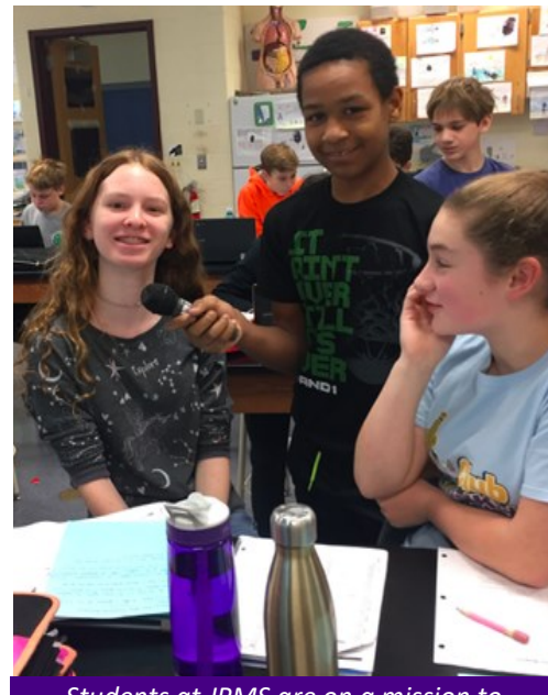
Students at JPMS are on a mission to reduce disposable water bottle use.