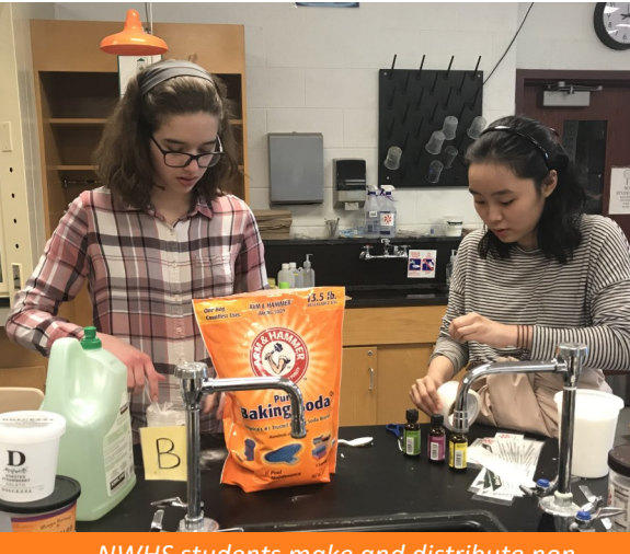
NWHS students make and distribute nontoxic cleaning scrubs and sprays.