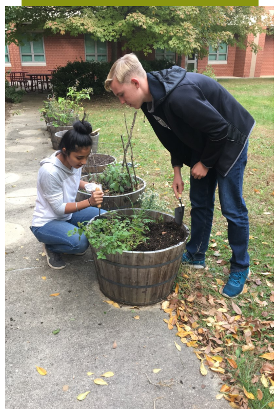
Students make sure that NWHS' garden planters are kept in the optimum condition. They're currently growing peppers, tomatoes, garlic, strawberries, raspberries, and a variety of herbs.

The two schools that did an excellent job in all three of these areas, Northwest High School (NWHS) and John Poole Middle School (JPMS), have won first place for their conservation efforts, which are highlighted on page 2.