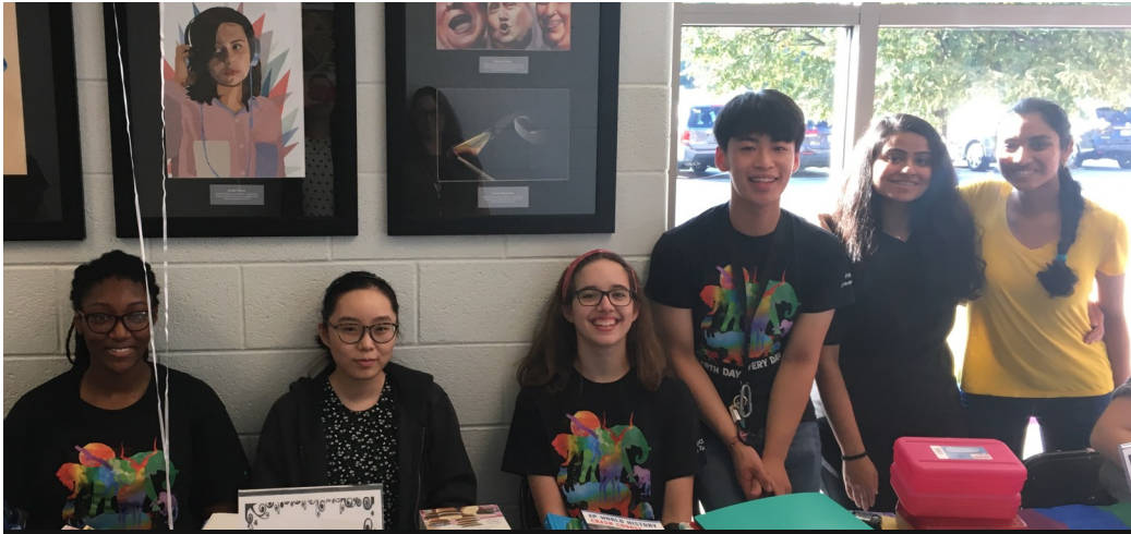
Students take advantage of NWHS events to spread the word about the Green Team's initiatives like the Free Store, where used school supplies are donated and redistributed.