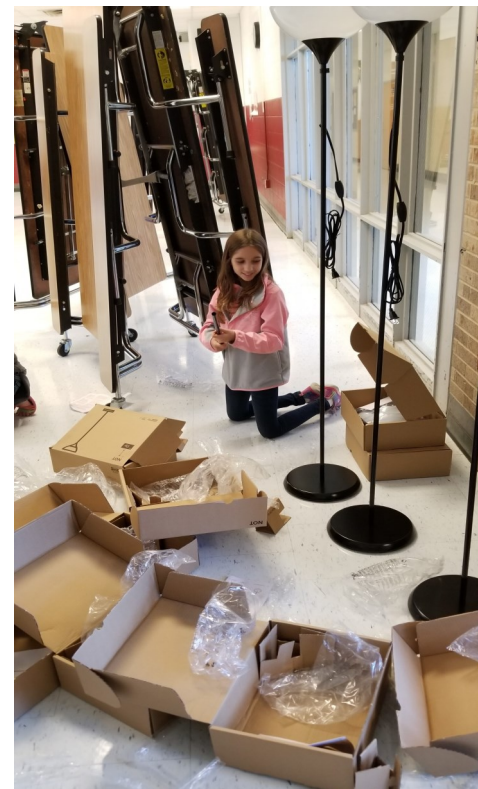
ABOVE: Members of Redland Middle School’s SERT Team assembled torchier lamps for use in selected locations of the school.