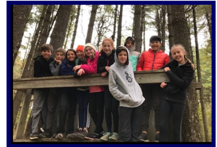
Risk-taking at Outdoor Ed