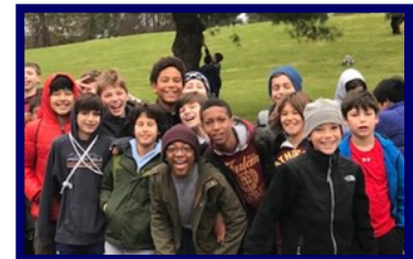
Open-mindedness with Peers