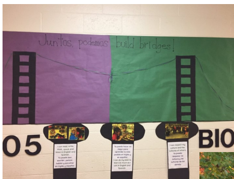
Building language bridges in Kdg TWI