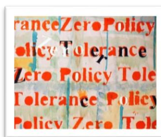
Malaika Temba SBJ 2015