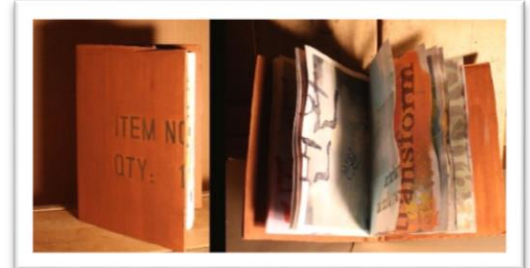
Ester Kim SBJ 2013

1 st Quarter 2018 you must have 10 pieces in your SENIOR SERIES ( 6 works + 4 supporting work)