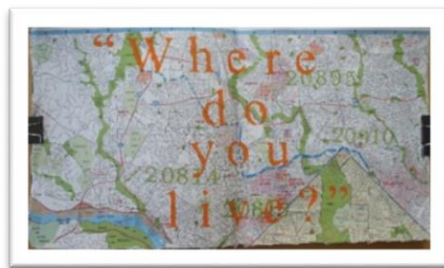
Rachel London SBJ 2016