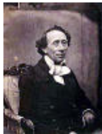
Hans Christian Anderson

This noted Englishman had much difficulty in school. He later became a national leader and an English Prime Minister.