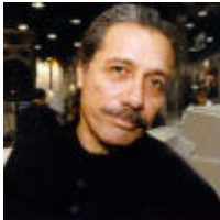
Edward James Olmos

He was a Renaissance artist, sculptor, painter, and inventor. He is thought to have been dyslexic.