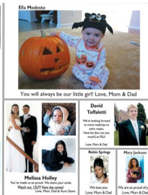
Quarter page ad