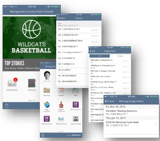
myMCPS Mobile Application