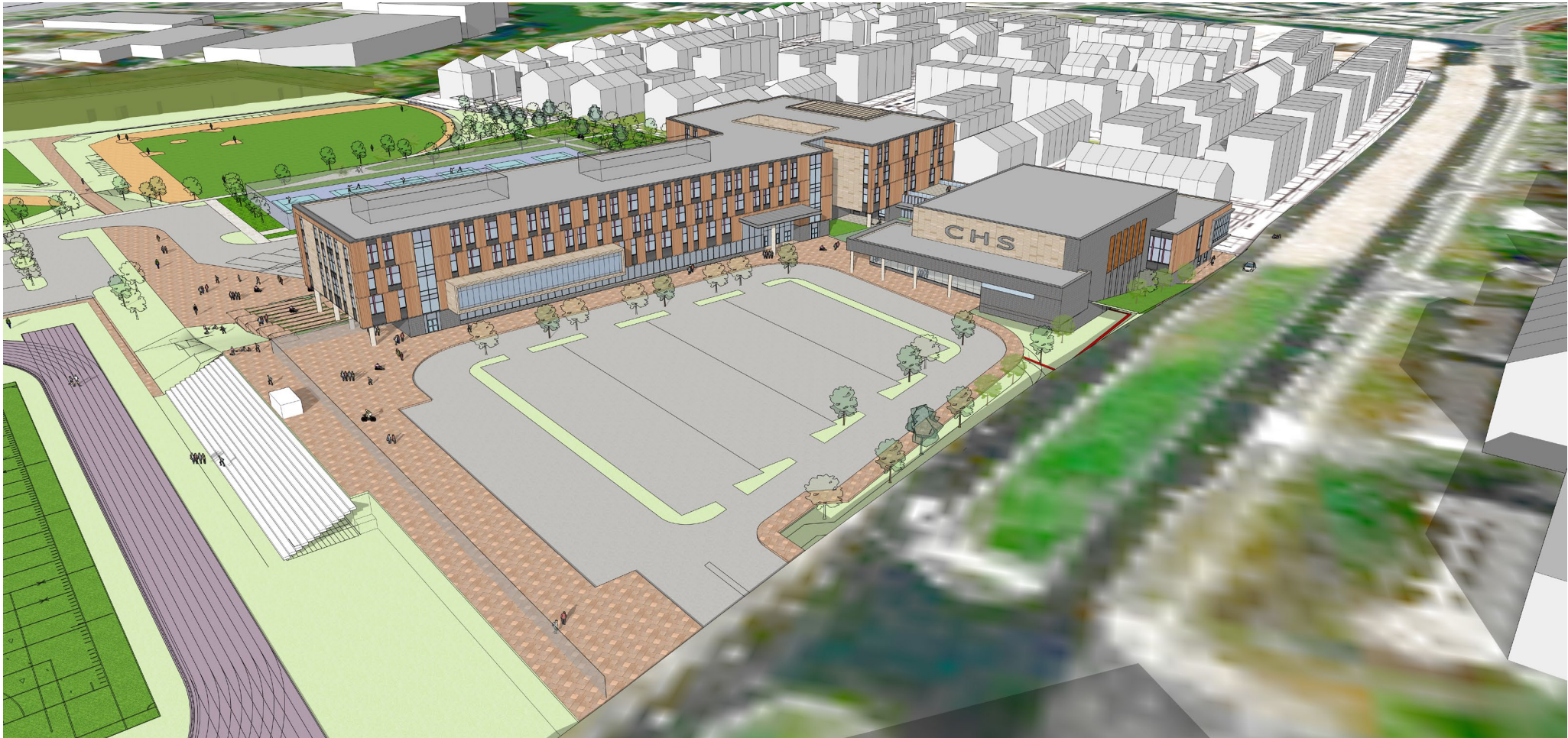
VIEW OF PARENT DROP-OFF LOOP