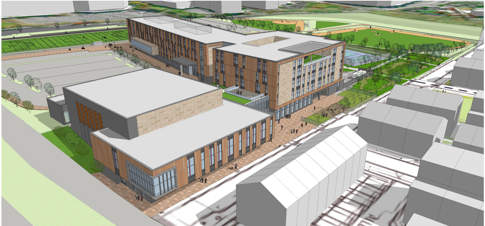
VIEW PERFORMING ARTS WING