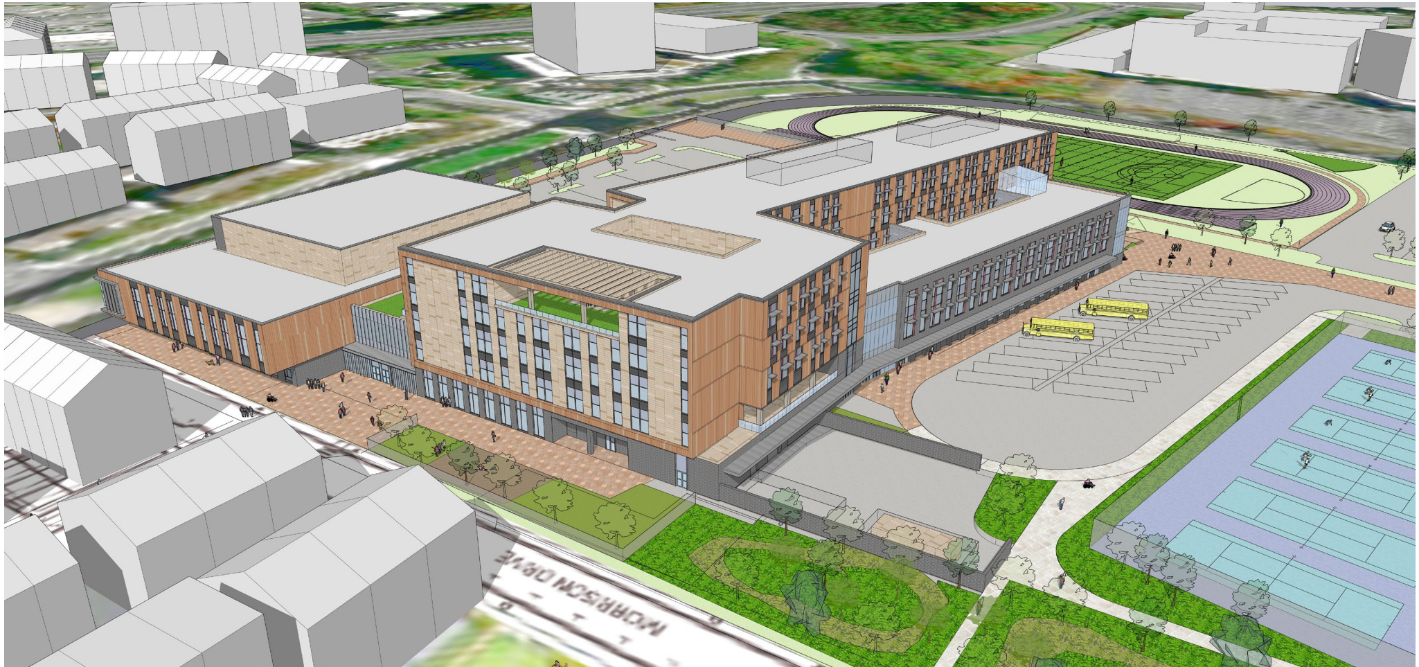
VIEW OF BUS LOOP / GATEWAY ENTRANCE