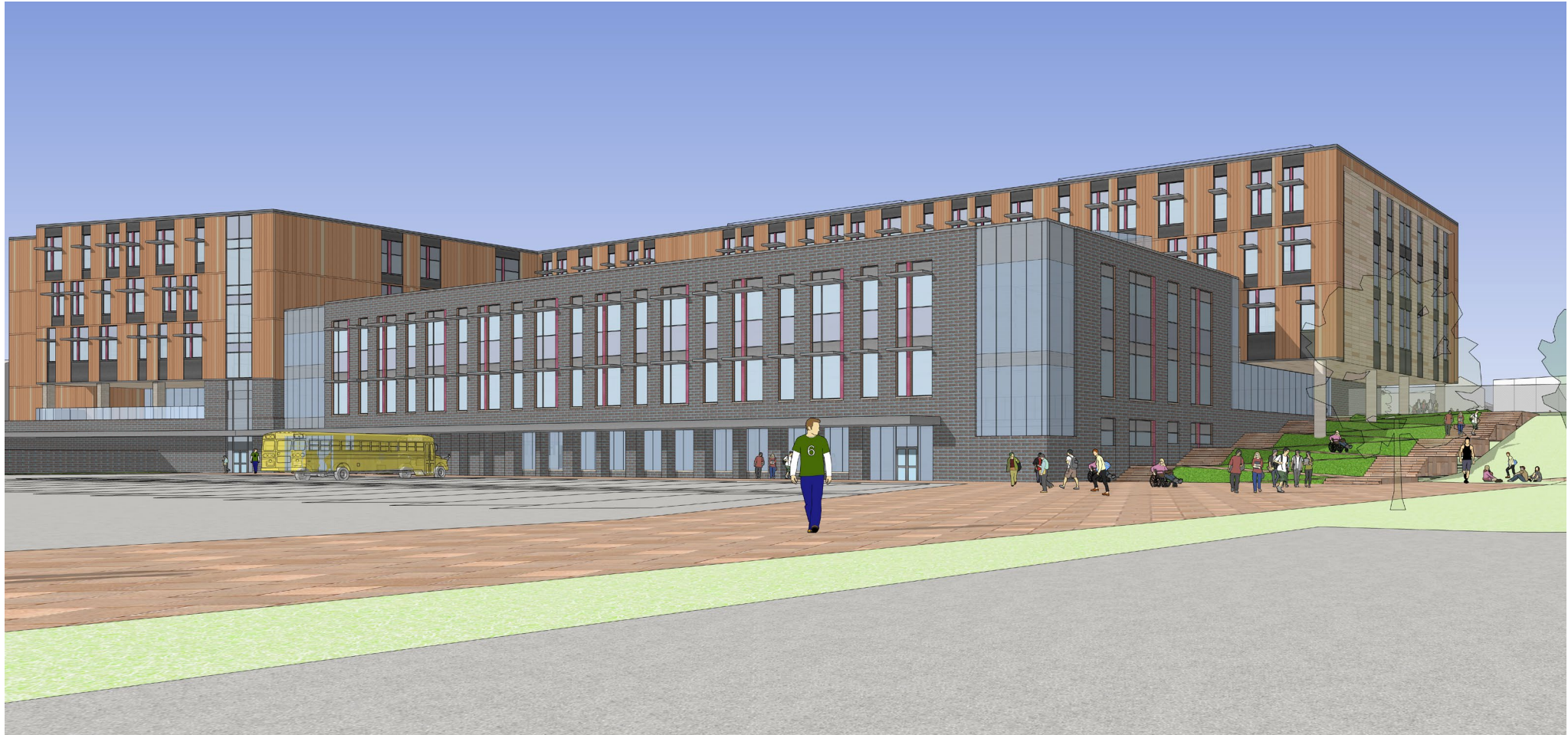
VIEW OF GROUND FLOOR (GYM) ENTRANCE