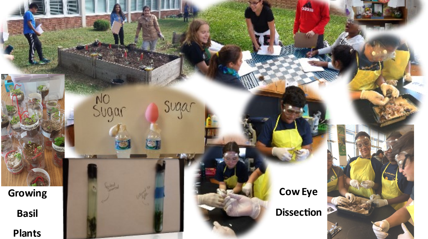
Growing Basil Plants