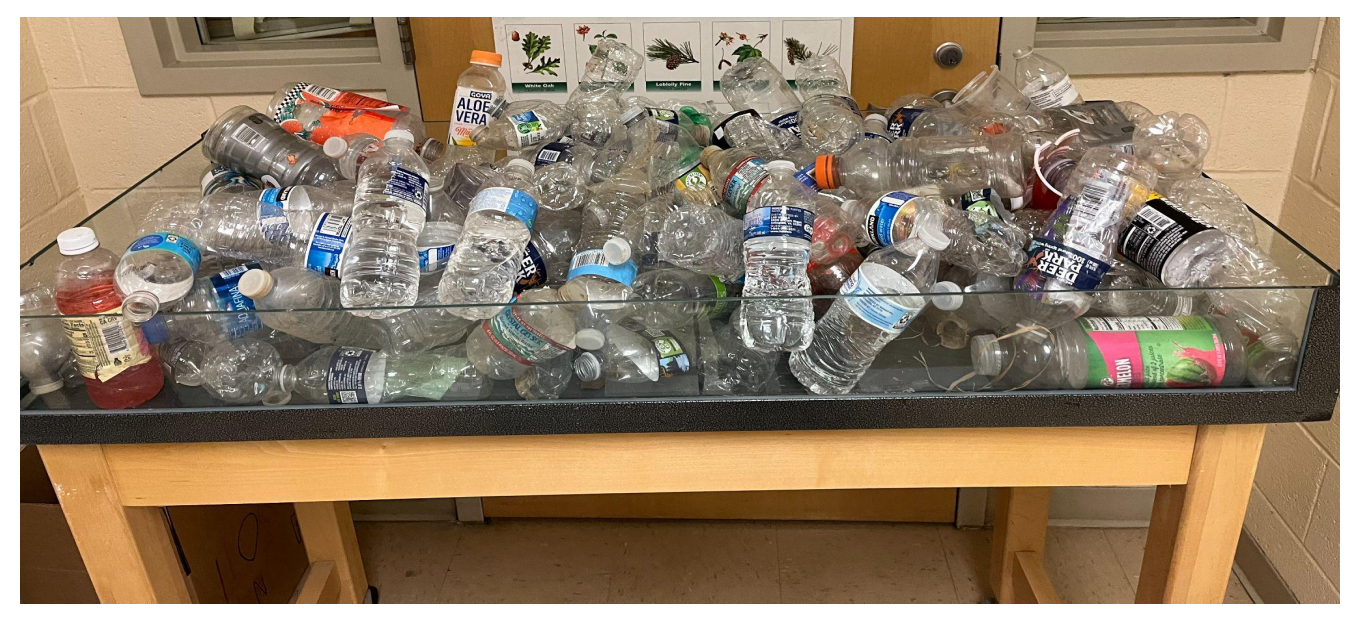
Water bottles in front of 6th grade science room (majority of the bottles are not empty)

3. Plastic does not recycle well. Usually plastic is recycled one time into less plastic that cannot be recycled. People should use aluminum cans instead of plastic cans and recycle them. Another alternative is reusing forks and knives, instead of plastic. Use reusable bags instead of plastic bags, use reusable water bottles instead of bottled waters. Don't overwhelm yourself with everything, choose one thing. Trying to change everything at once can be overwhelming. So instead of trying to change everything at once try to change one thing.