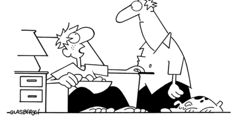
"These days children move back home after college. If I'm already home, why do I need college?"