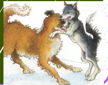
The Call of the Wild