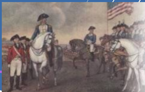
Native Americans in the Revolution