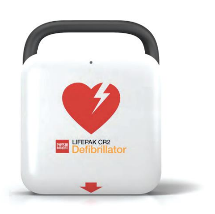
Lifepak CR2 AED