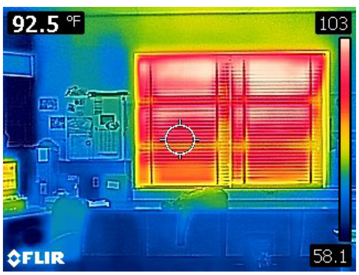
See the impact that solar gain has on a wall with windows.