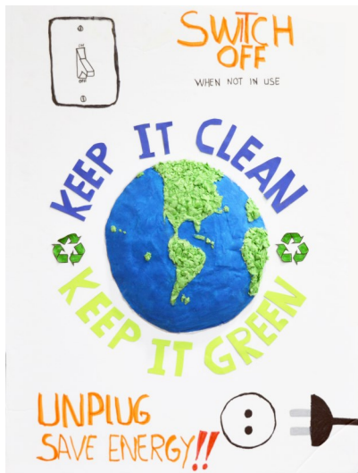
Mila Sanchez, Grade 2 Somerset Elementary School