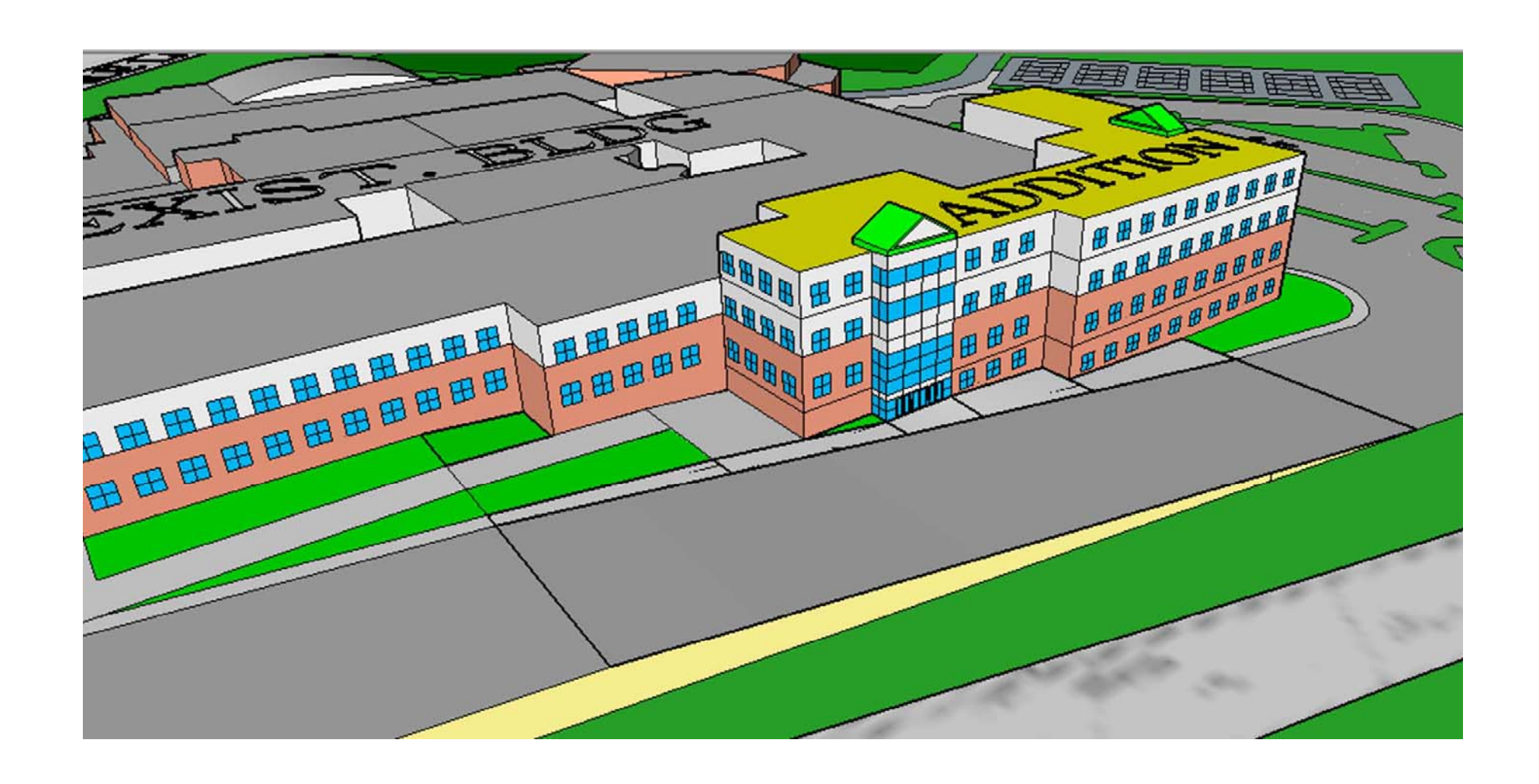
Option 2 view of front of addition