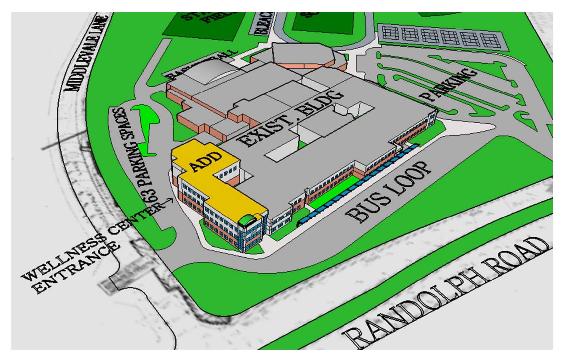
Option 1 view of left front