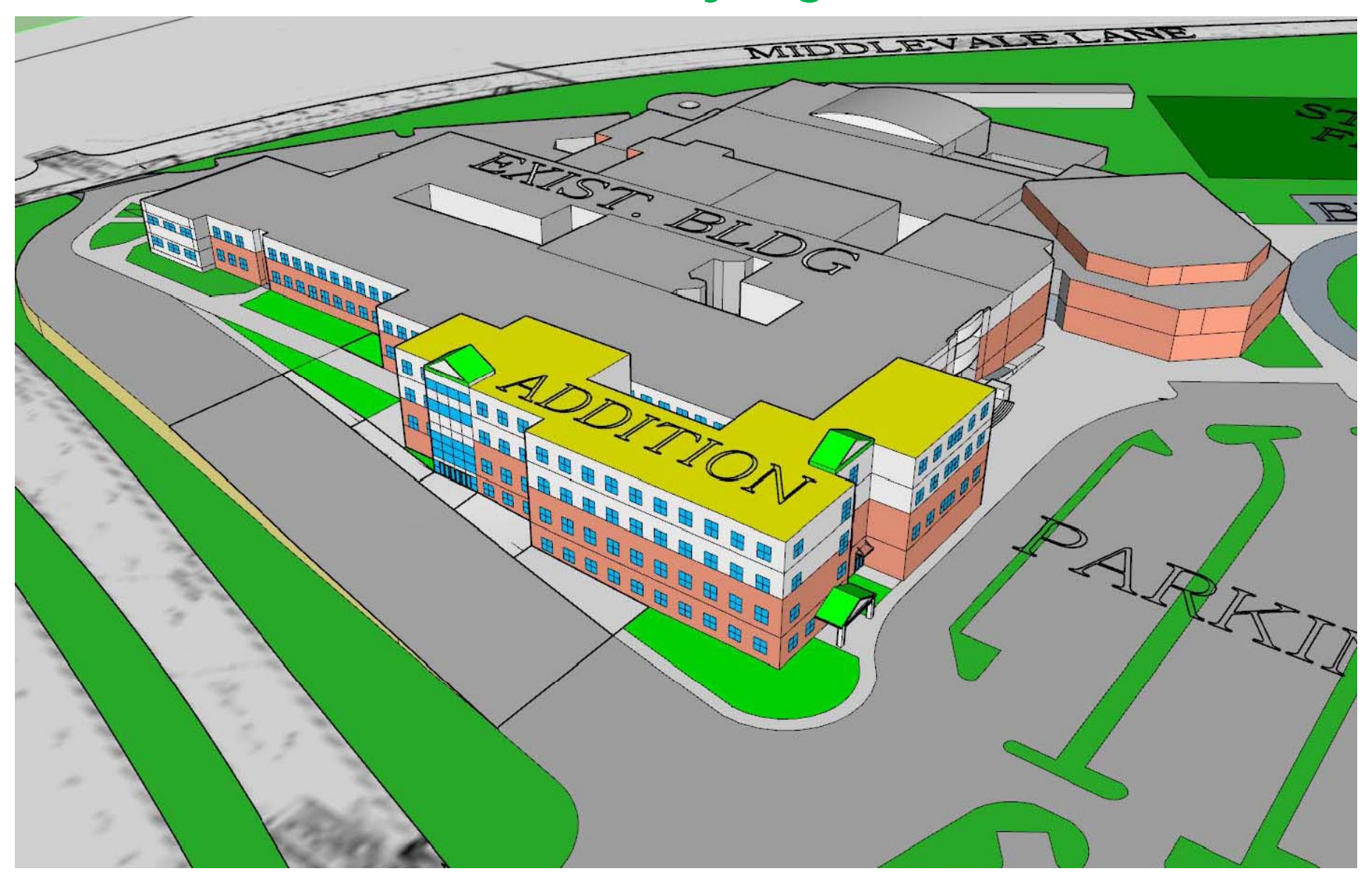
Option 2 view of right front