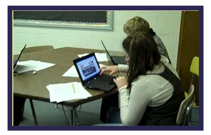
Students at Redland MS use netbooks to explore an online simulation website to build background knowledge prior to starting a new reading unit.

A student at Galway uses the text-to-speech feature of Kidspiration to practice reading fluency.