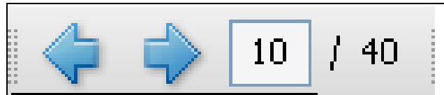
Navigation Arrows and Page Indicator in Adobe Acrobat