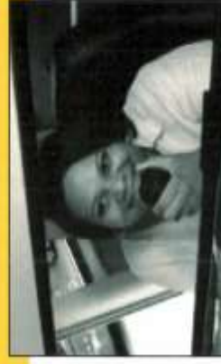
Obey the bus operator just as you would a teacher or school administrator.