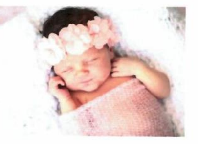
Step 2 Add your photos