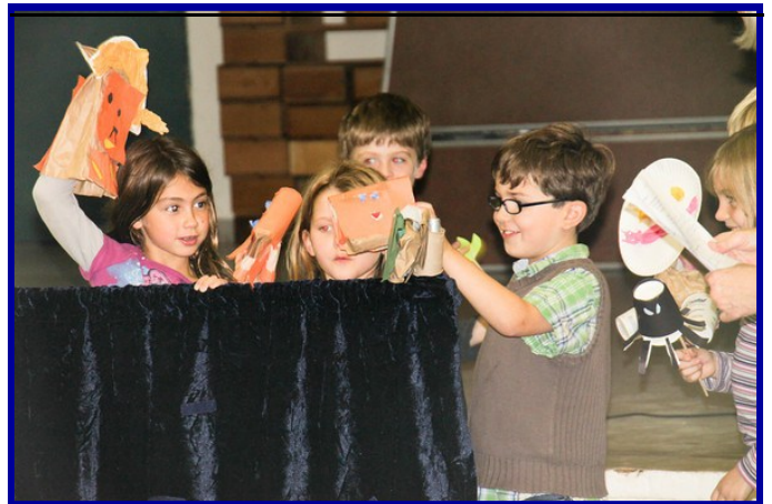
A puppet performance