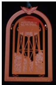
2010 Water Tower Ornament