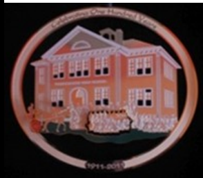
2011 Pooleville HS 100th Anniversary Ornament. PHS as it looked 100 years ago!