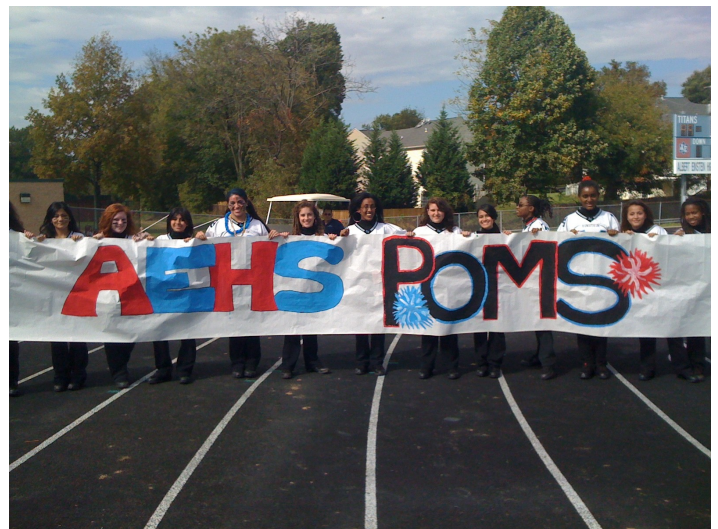
Poms have spirit! See them perform at pep rallies and during the half-time show at all Titans’ home games.