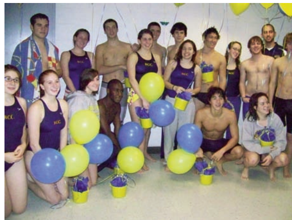
SWIM TEAM SENIORS