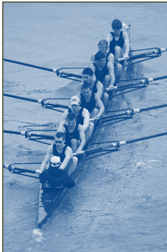
Boys Varsity 8 racing on the Potomac