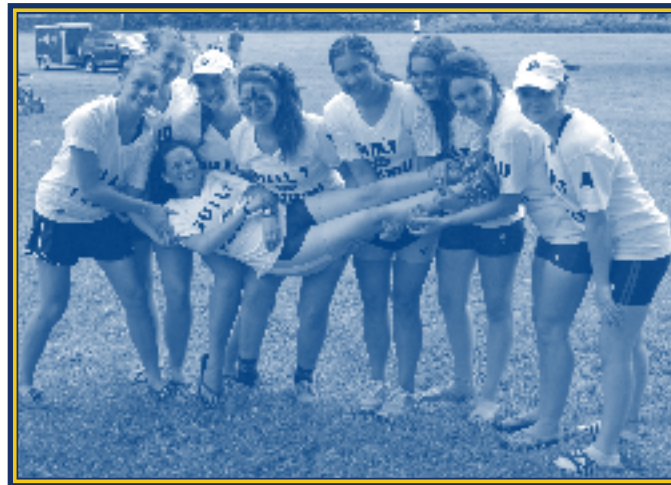
Girls Varsity 8 relax after Nationals