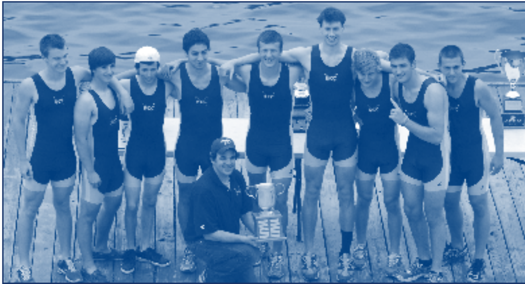
Boys Varsity 8 victorious at Washington Metropolitan Interscholastic Rowing Association (WMIRA)