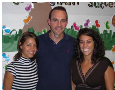
Your 5th Grade Team

Writing for personal expression will be the focus at the start of the year in writing . In September, students will focus on establishing