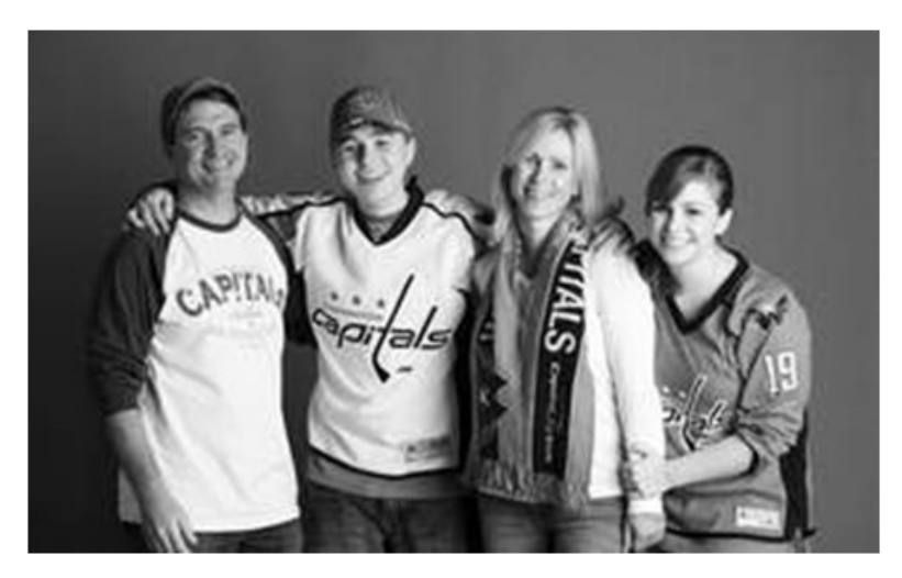
The Moore Family

"We are each of us angels with only one wing, and we can only fly by embracing one another" ~Luciano De Crescenzo