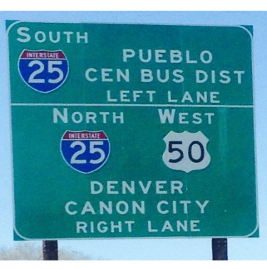
1,700 Miles from Damascus MD to Denver, Colorado

After helping our son fix up his new apartment a bit, we hiked at Red Rocks Park and saw extremely picturesque scenes! There is also a really fascinating amphitheater built directly into the rock formations! Overall, my Spring Break trip was a success, but the next time I see my son in Denver, I definitely plan to fly!