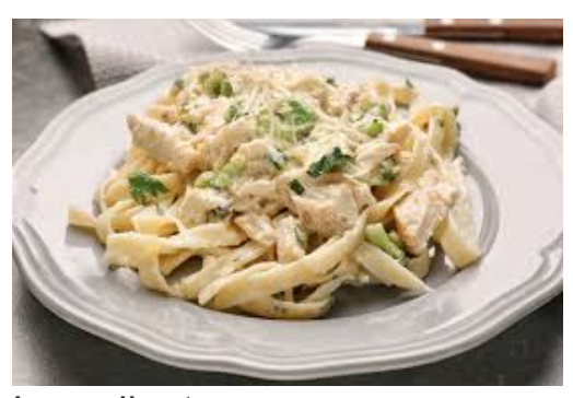
Ingredients 1 ½ lb. chicken breast cubed 2 tablespoons butter 3/4 teaspoon Italian seasoning ½ teaspoon salt and pepper 16 oz pasta cooked