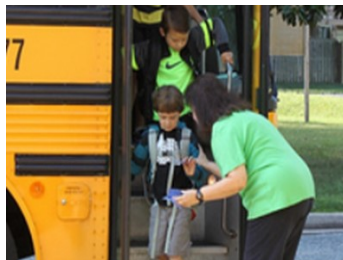
Students arriving on the first day of school