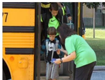
Students arriving on the first day of school