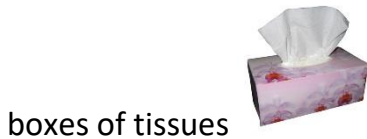
boxes of tissues

The following items may be welcomed for donations but are not required: