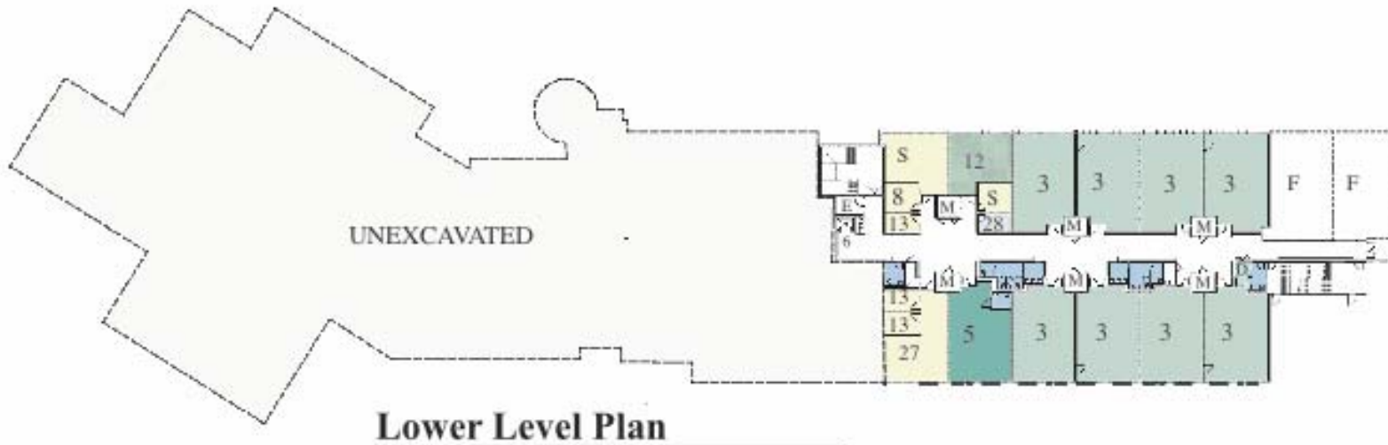
Lower Level Plan