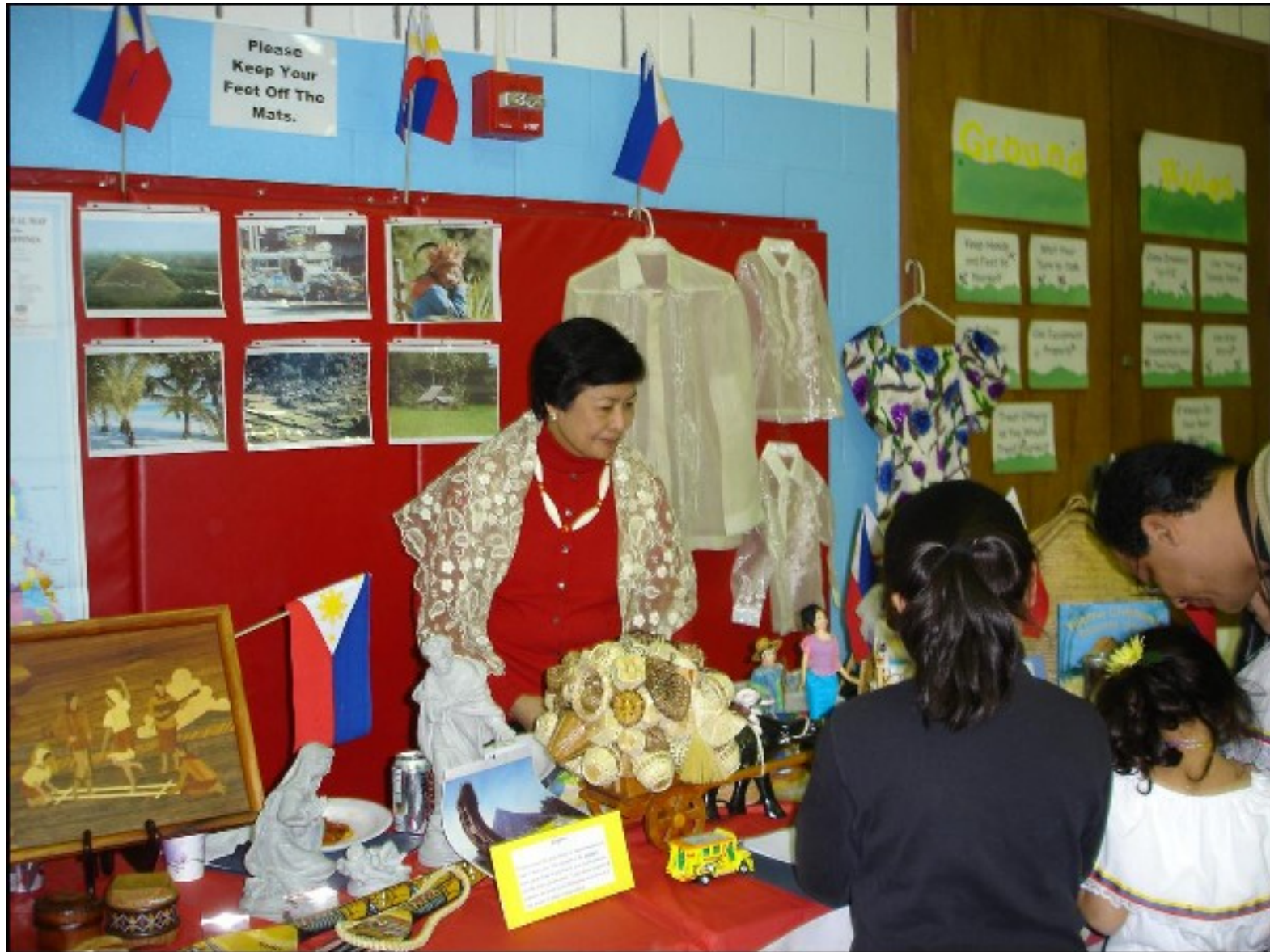
International Night, celebrating the diverse cultures in the DuFief School Community