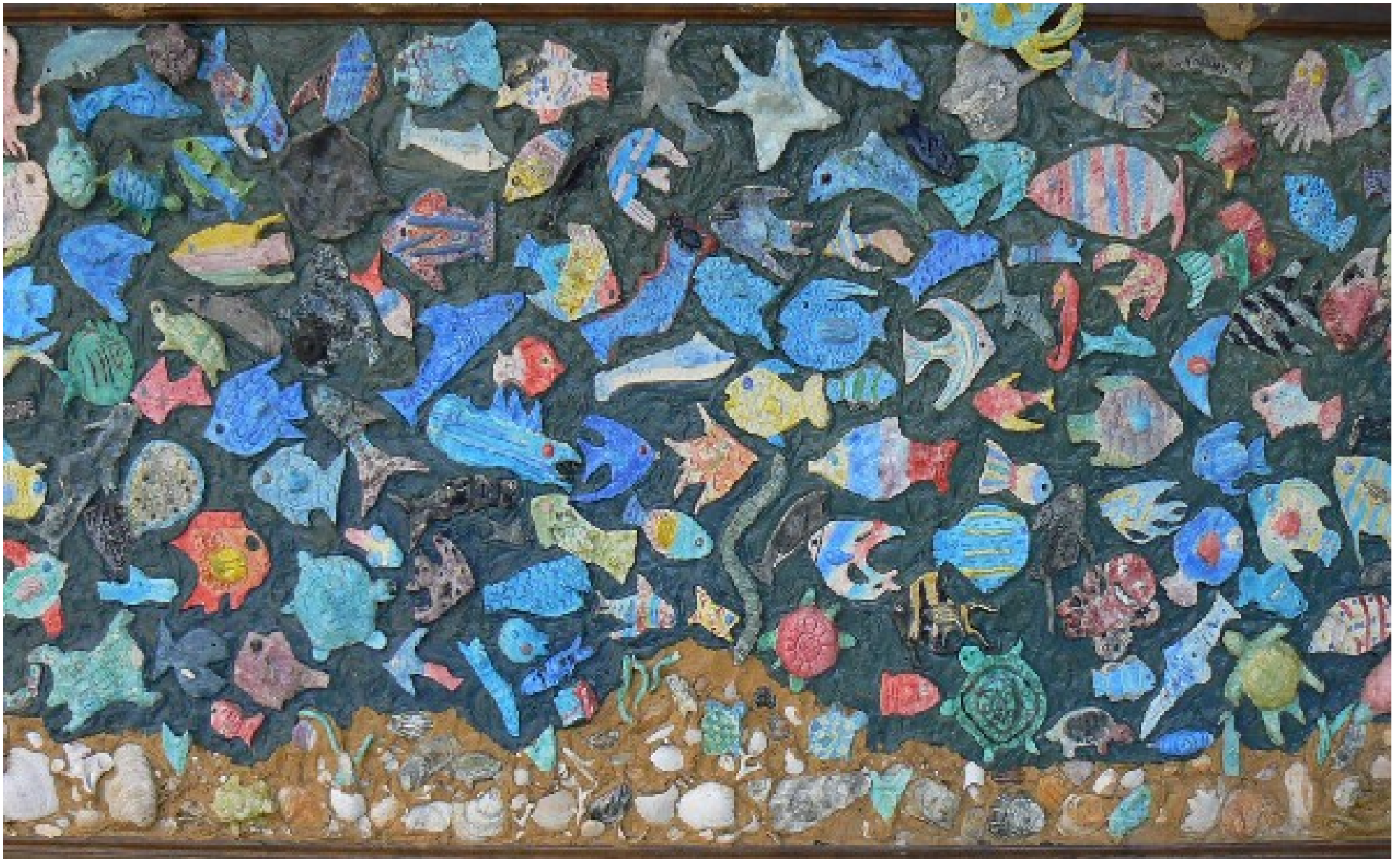
Clay Mural created in conjunction with Science - Grade 5