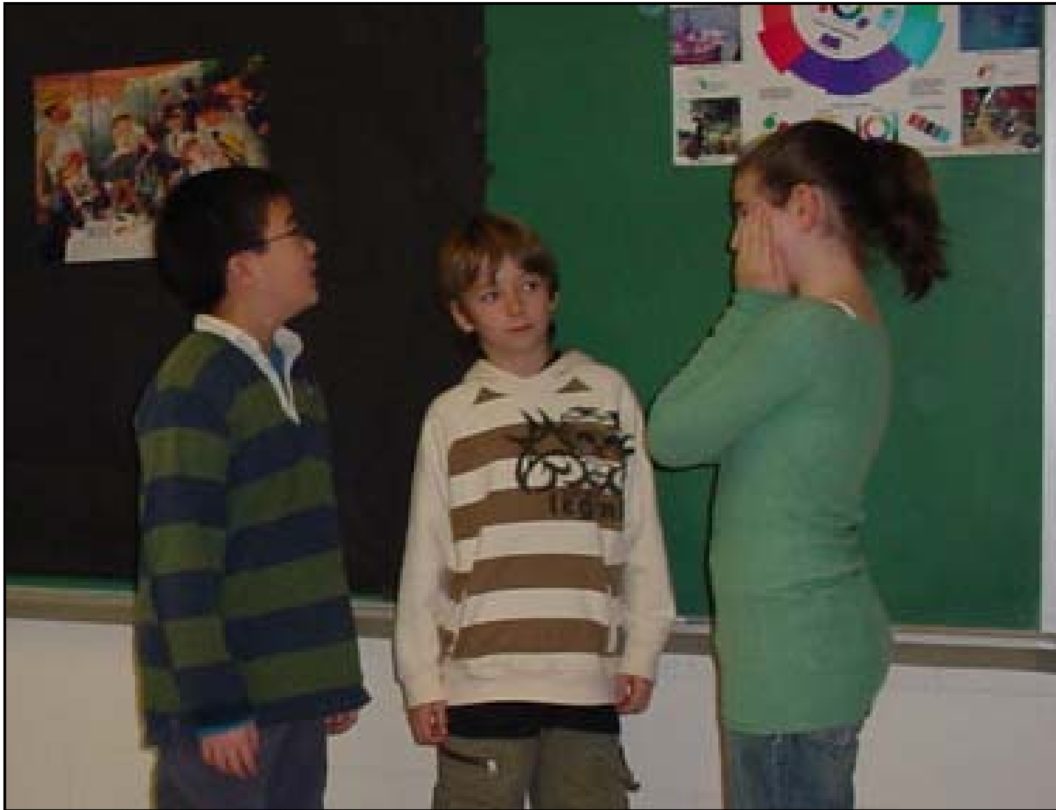
“The Luncheon of the Boating Party” Picture Tableaux - Drama and Visual Art