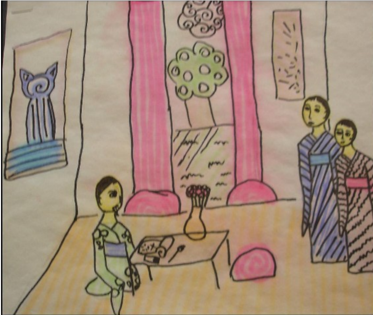
Visual arts with line drawing – Music and soundscape inspired by ‘The Big Wave’ by Pearl S. Buck.