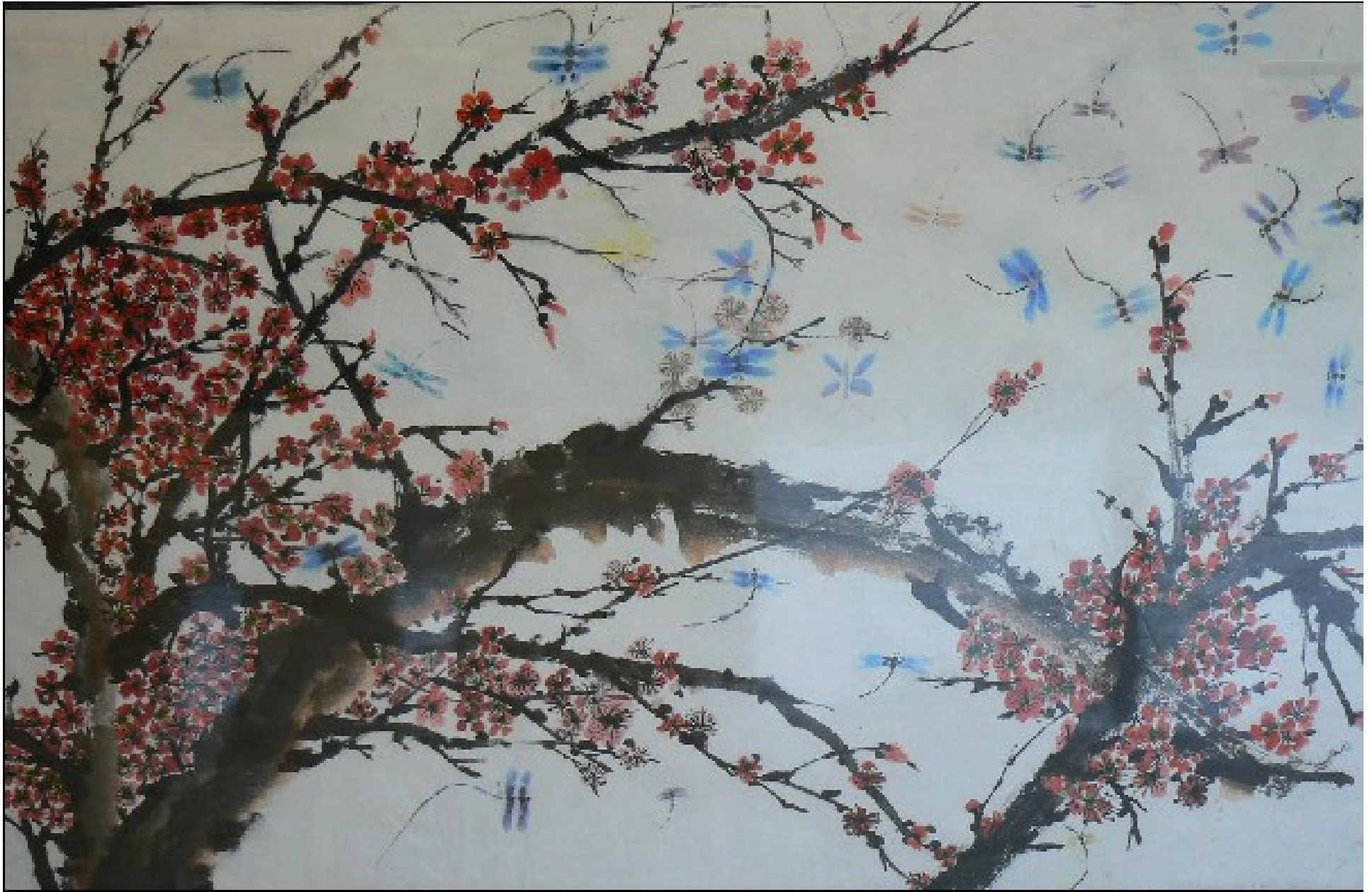
Asian brushstroke panels (Four Seasons) Created with Artist-in-Residence - Grade 5