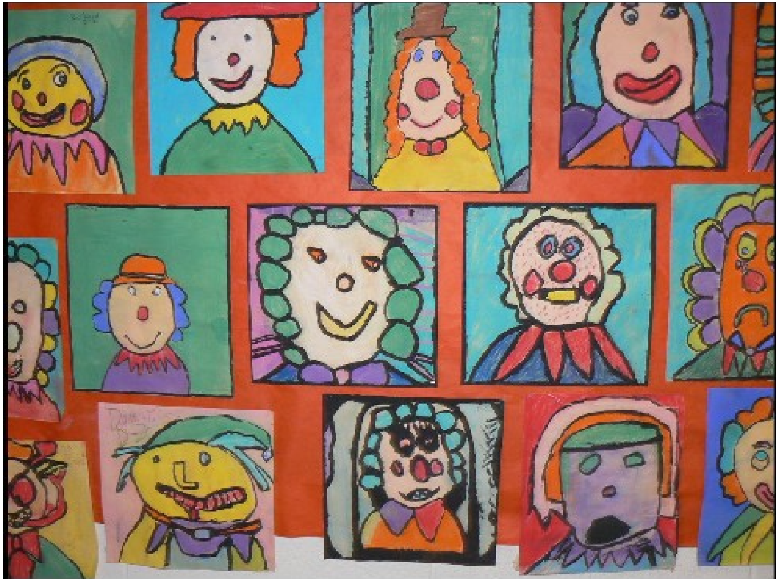
Clown Portraits – Grade 2