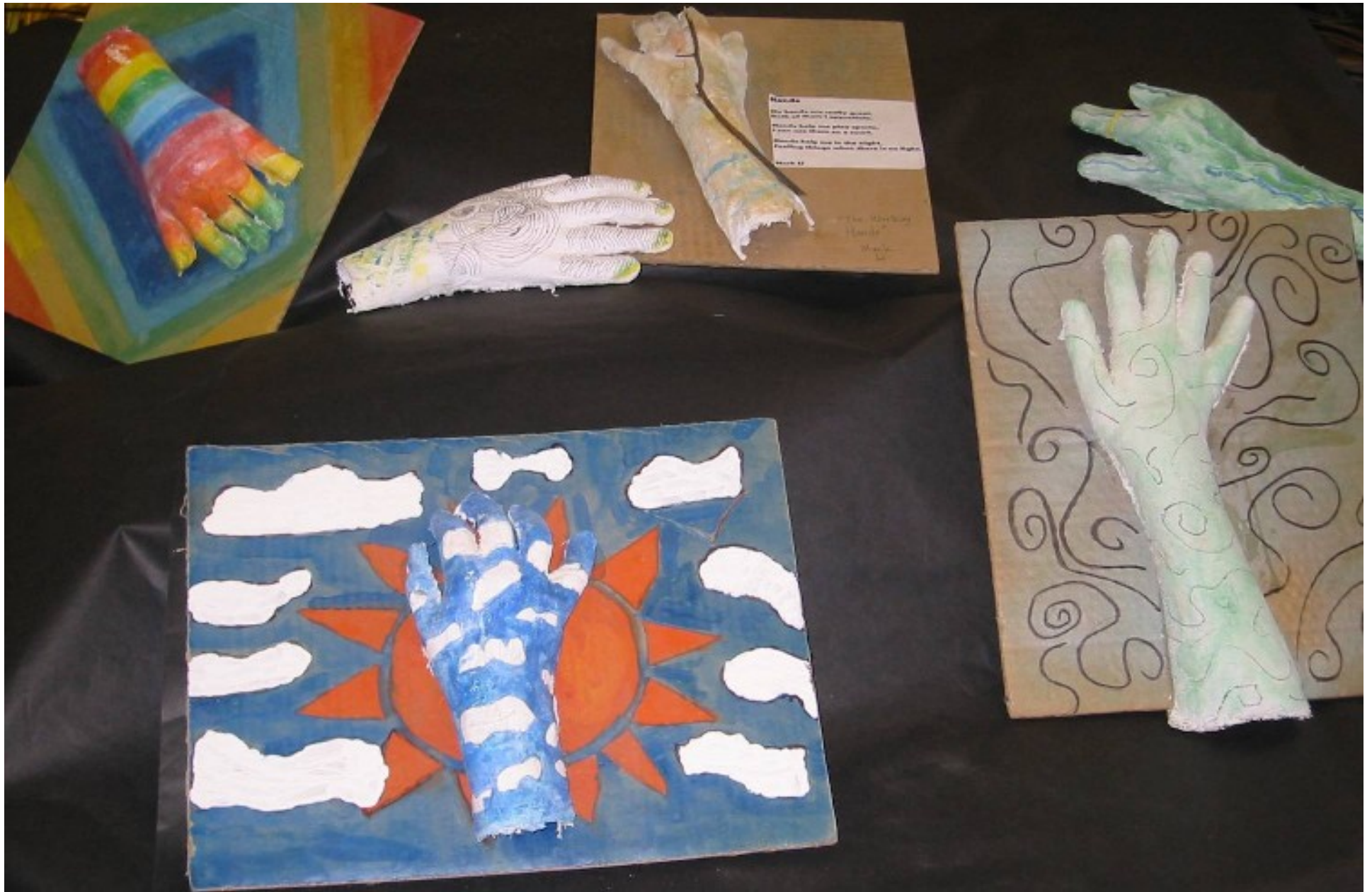
Low relief hand sculptures & accompanying poems Grades 4 & 5