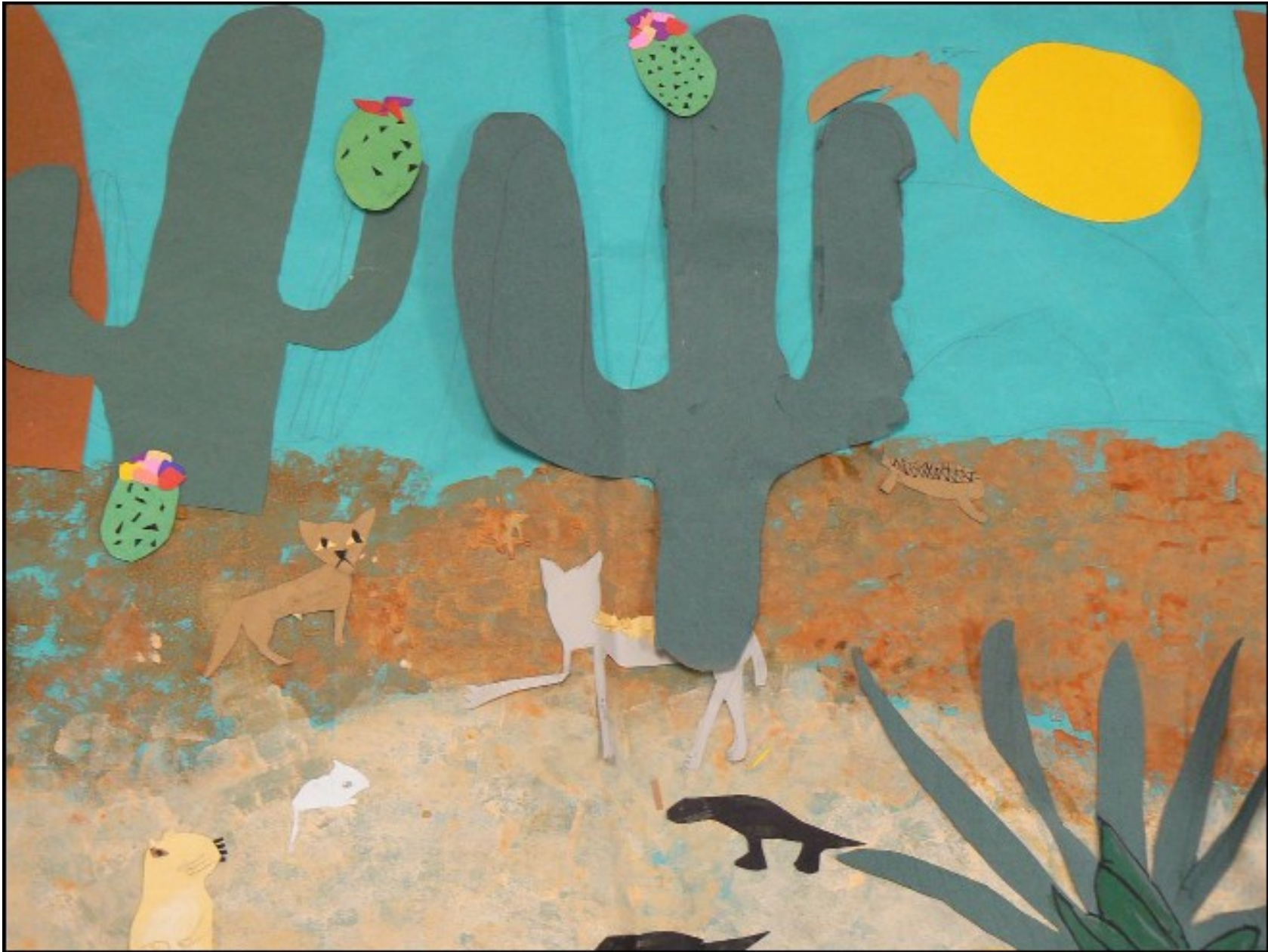
Social Studies Unit, Regions of the World – Grade 3