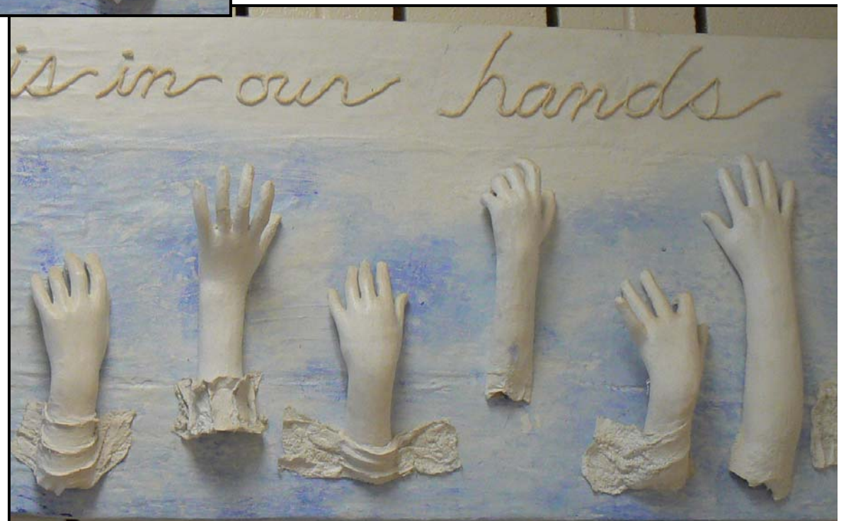
Artist-in-Residence Program Low Relief Sculpture