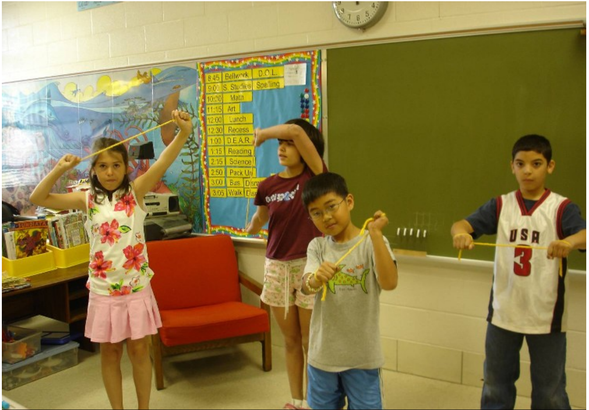
Science unit - sound vocabulary integrated with dance – Grade 3