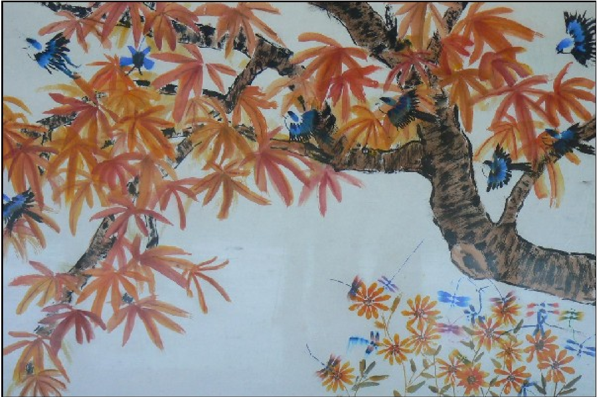
Asian brushstroke panels (Four Seasons) Created with Artist-in-Residence - Grade 5