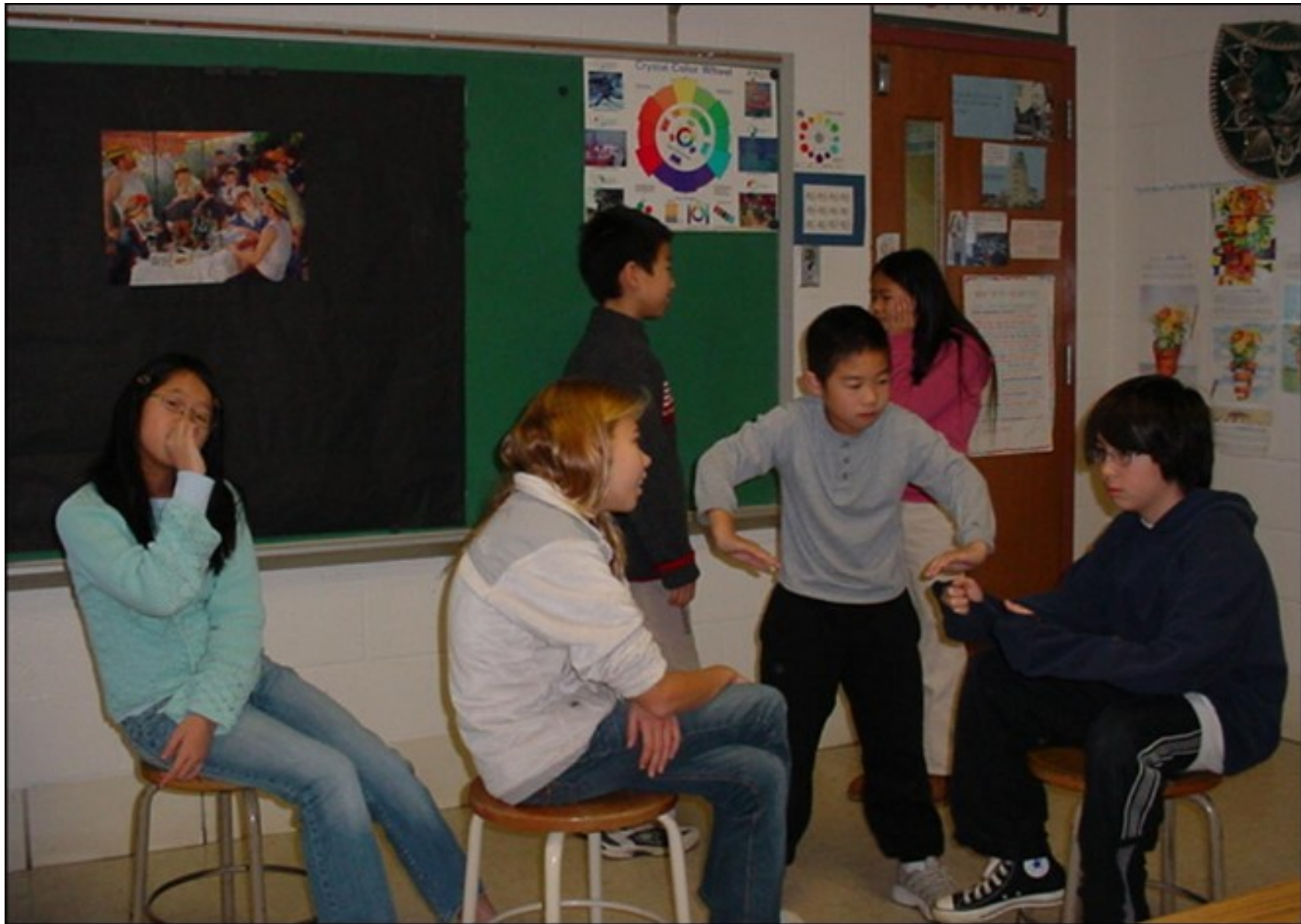
“The Luncheon of the Boating Party” Picture Tableaux - Drama and Visual Art