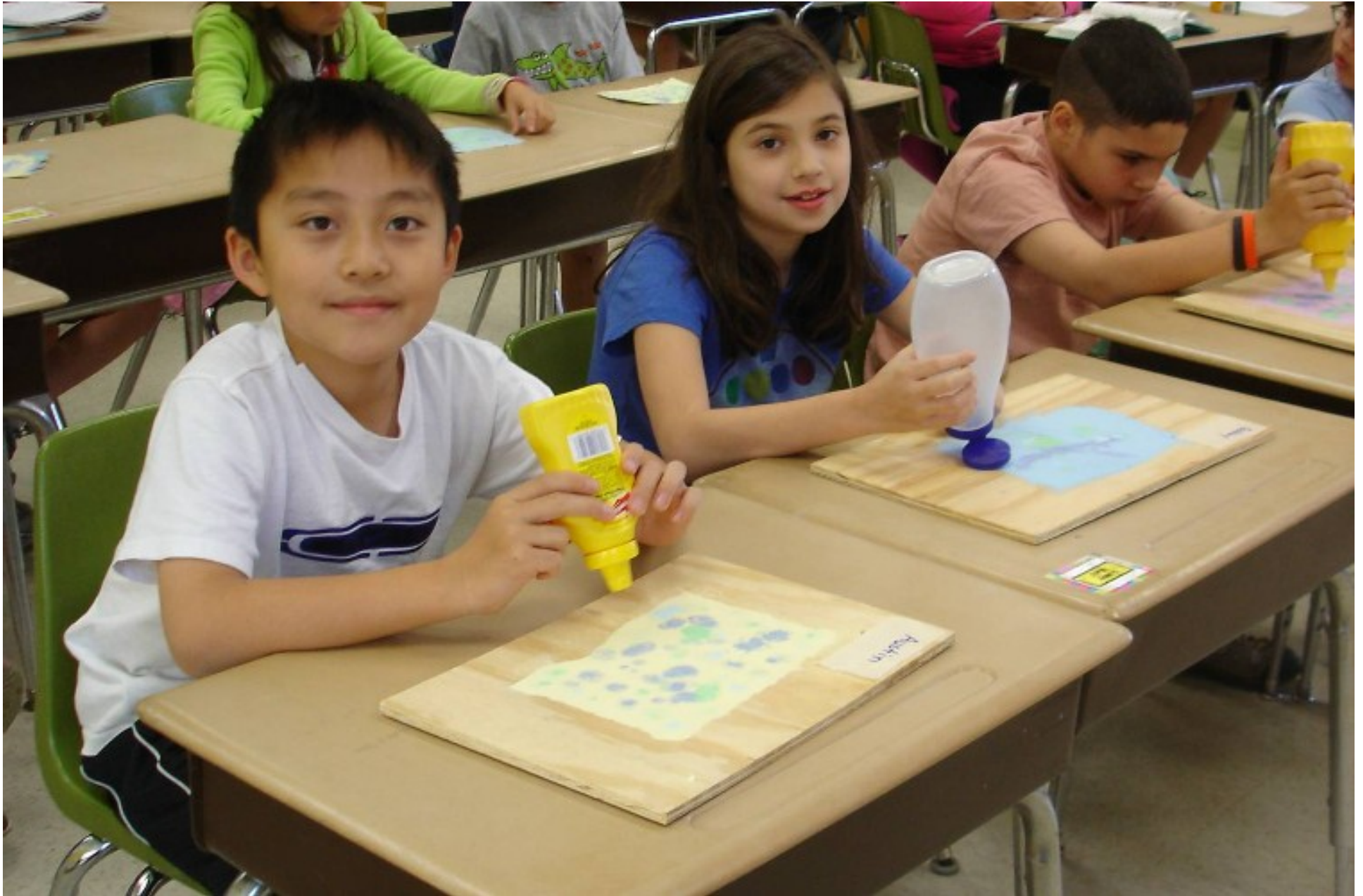
Visual Arts and Diamante poetry - paper making from recycled paper