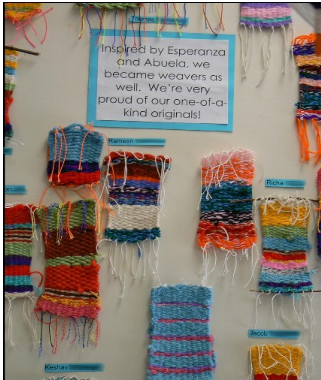
Weavings – Grade 3