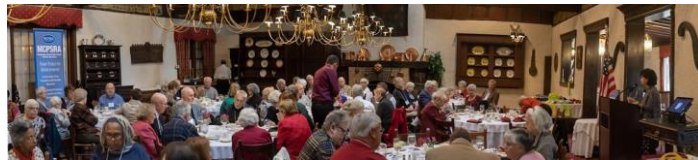
Members enjoying themselves at our October luncheon.

Business meeting/luncheons are held four times a year at the delightful Normandie Farm Restaurant, 10710 Falls Road, Potomac, MD 20854.