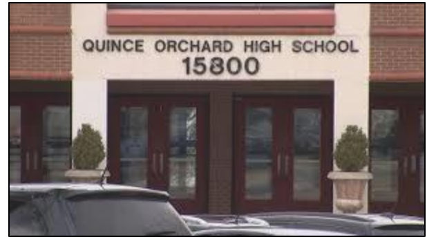
Quince Orchard High School – Main Entrance