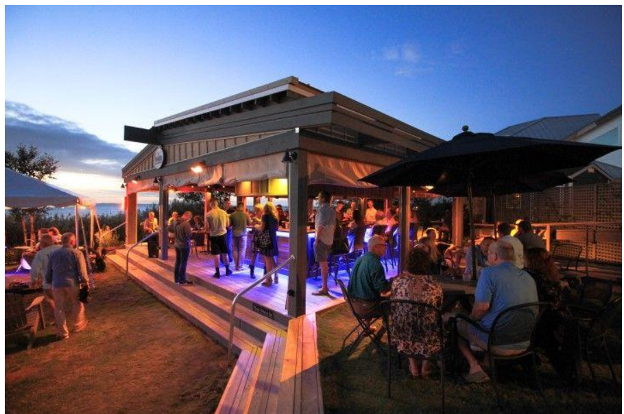
Blue Point Restaurant, Duck NC