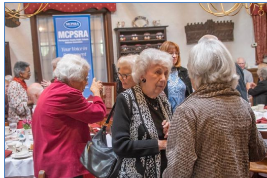
Members enjoying themselves at our October luncheon.

Business meeting/luncheons are held four times a year at the delightful Normandie Farm Restaurant, 10710 Falls Road, Potomac, MD 20854.