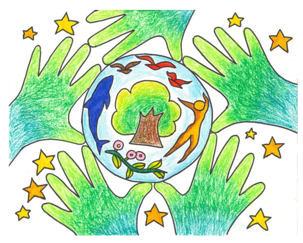
Sophia Liu, Grade 5 Fox Chapel Elementary School