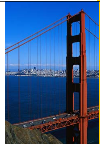
The Golden Gate Bridge

When the Golden Gate Bridge was finished they held a Pedestrian Day. The Golden Gate Bridge was made in 4 years.