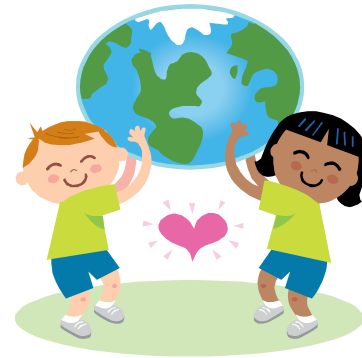
Students will recognize acts of character all week.

The officers and representatives wonder how many acts of character will occur at Diamond Elementary. They ask that you encourage your child at home to also use character. As a family, you can make a prediction of how many acts of character will occur at home.