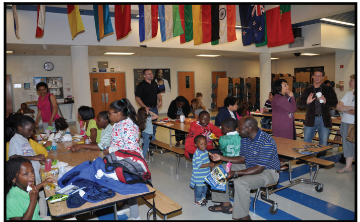
Students, parents, and staff enjoy time together at Closing Ceremonies at Sherwood High School.

We encourage you to visit any of the centers for a tour or to observe the sessions. Just call the GBTLA main office to let us know where you will be visiting so we can make sure the center director will be available to welcome you.