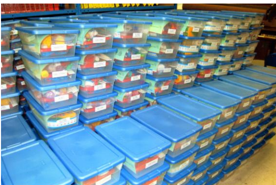
Some of the toolkits ready for delivery to schools.