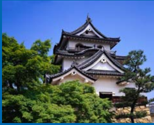
Building in Japan