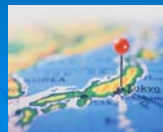
Map of Japan

Japan is a small country in Asia. It is also an island. Korea is near Japan. Korea is the only country that is nearby Japan because Japan is at the end of Asia. The bodies of water that surround Japan are Sea Of Japan, East China Sea, Philippine Sea, and North Pacific Ocean. So when you visit Japan make sure you don't fall in the water!